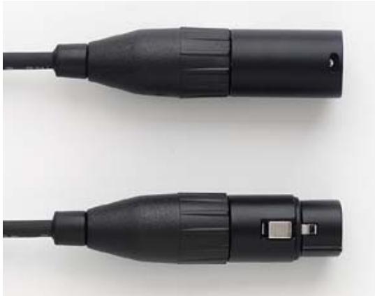
Model 6902 3-Pin XLR (M) to XLR (F) patch cord: 10, 15, 20, 25 feet.

Dramatically reduce your audio system support costs.